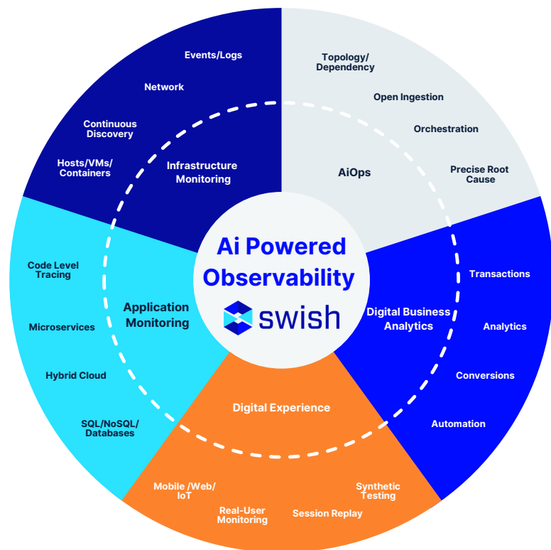
AI Powered Observability All-in-one platform with a single source of truth.

Swish teamed with Dynatrace, the market leader in Observability, to provide AI-Powered Observability which delivers a full stack, automated, single agent software-intelligence monitoring platform that simplifies enterprise cloud complexity and accelerates digital transformation. The all-in-one platform brings AIOps, digital experience management, infrastructure monitoring, application performance, and digital business analytics into a single automated solution. With AI-Powered Observability and complete automation, the all-in-one platform provides answers, not just data, about the performance of your applications, their underlying infrastructure, and the experience of your end users.