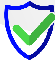
STIG for Dynatrace